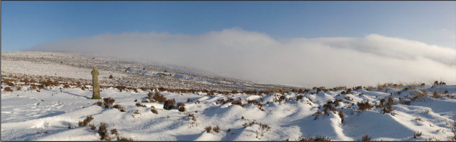
Bennett's Cross with snow drifts and finally managed in the winter of 2010. Birch Tor is hidden in the mist on the horizon.