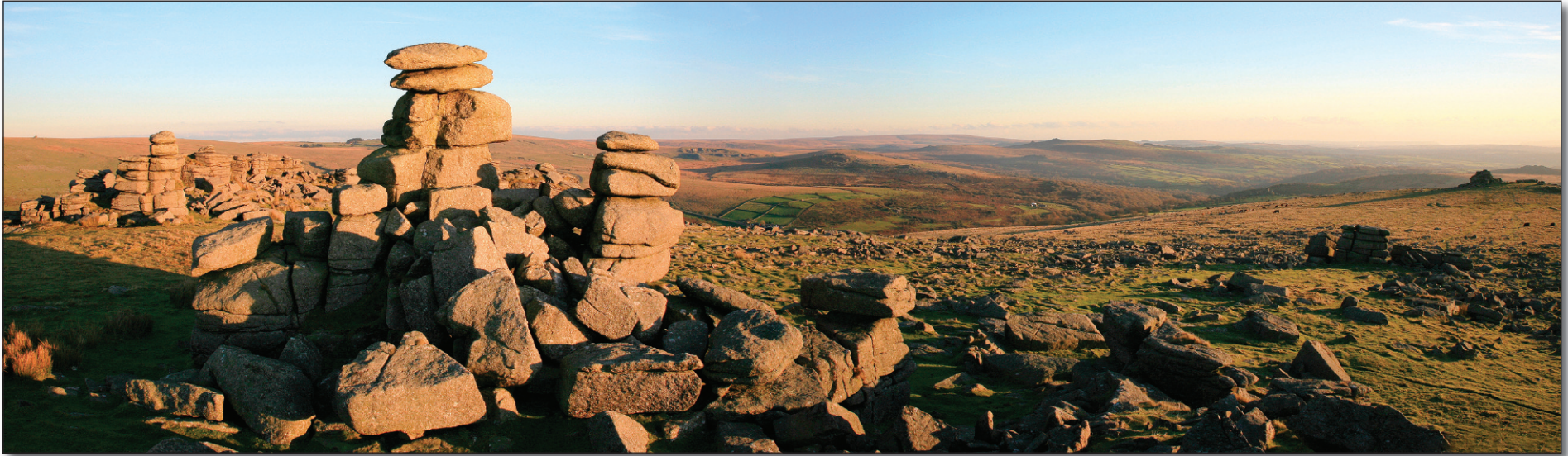
This picture is taken from one of the highest points on Great Staple Tor just before sunset in late autumn. Many other tors can be seen in the distance including Vixen Tor, Feather Tor, King Tor, Sharpitor, Sheepstor and Hucken Tor.