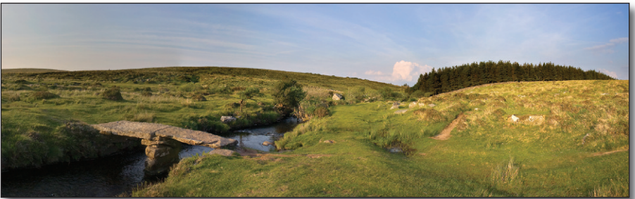
Late afternoon light at a small clapper bridge at Wallabrook. Dartmoor has many clapper bridges, the best known being Postbridge.