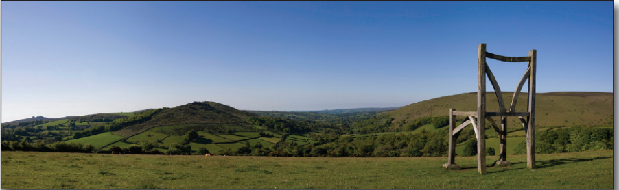
The Giant's Chair sits on private land above the East Webburn river valley looking south towards Widecombe-in-the-Moor.